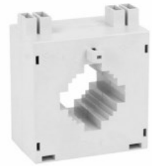
Current transformers DM3T0400